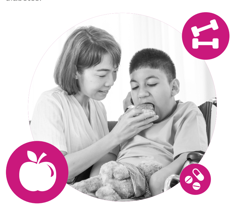
SOURCES: niddk.nih.gov/health-information/diabetes/overview/symptoms-causes#causes; cdc.gov/diabetes/managing/manage-blood-sugar.html; cdc.gov/diabetes/basics/symptoms.html; diabetes.org/resources/statistics/statistics-about-diabetes; main.diabetes.org/dorg/docs/state-fact-sheets/ADV_2020_State_Fact_sheets_FL.pdf

Make sure your child takes their medications regularly and keeps up healthy habits. Don't know where to start? Talk to their doctor. Ask often how your child is feeling, both physically and mentally. This will help them feel supported and more prepared to cope with diabetes.